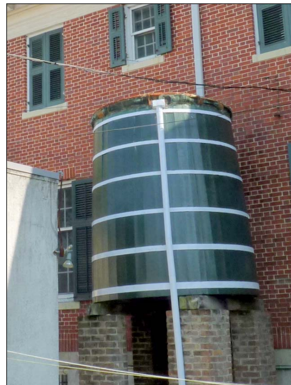
Cisterns, like this one at 1416 Broadway, have been used in Galveston since the city's founding.